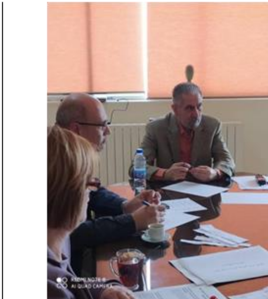
Photo No. 4. ABU Team

ERASMUS+ PROGRAMME Project Number: 610238-EPP-1-2019-1-JOEPPKA2-CBHE-JP