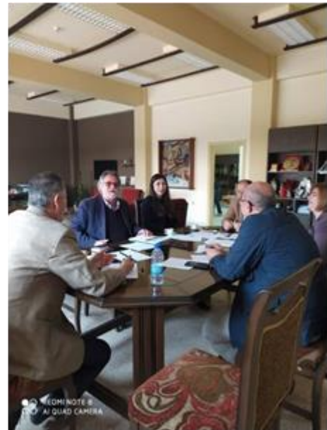
Photo No. 5. ABU Team