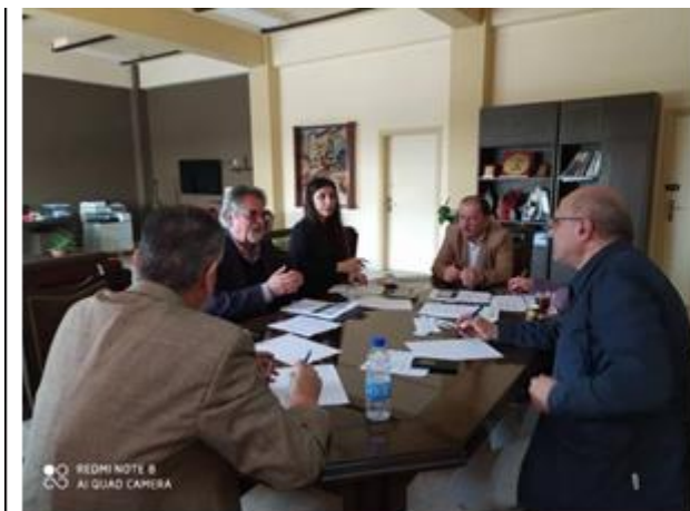
Photo No. 2. ABU Team